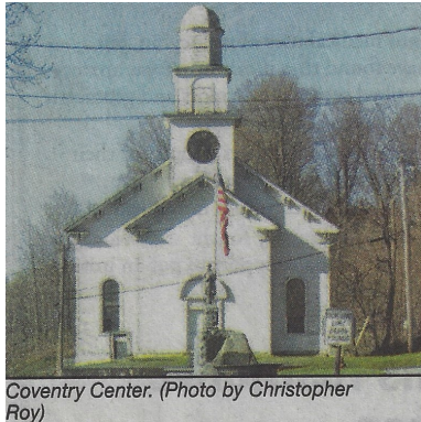
Coventry Center.

Mark your calendars: Sunday June 16 th will be a special worship for UCN. It is our sacred duty to bring to a conclusion a long and inspiring ministry. In 1831 UCN had its origin in a group of parishioners from the Coventry Congregational Church, now we say goodbye to the community that gave us birth.